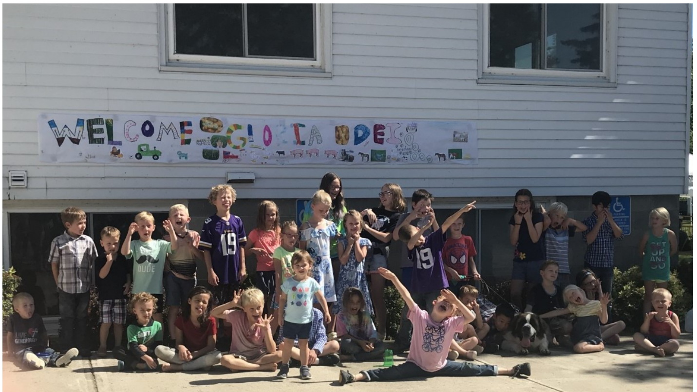
Waverly Lutheran Church and Gloria Dei Lutheran Church children rejoice!