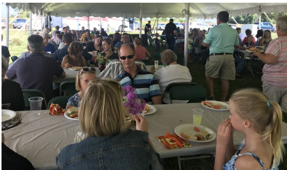
Everyone enjoyed a delicious potluck picnic with some classic Lutheran jello dishes and, pork chop on a stick!