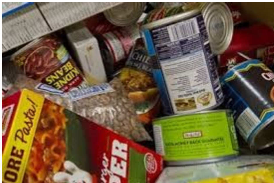
Gloria Dei's Annual Thanksgiving Food Drive